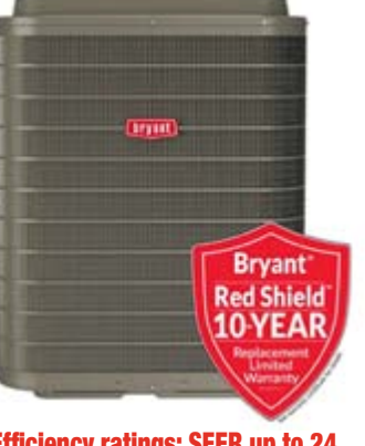
and HSPF up to 13.

Heat pumps save energy because transferring heat is easier than making it. Surprisingly, even when it feels cold outside, there is still a decent amount of heat waiting to be pumped. Under ideal conditions, a heat pump can transfer 300 percent more energy than it consumes. In contrast, a high-efficiency gas furnace is about 90 percent efficient.