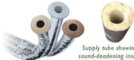
Supply tube showing its sound-deadening insulation

The Unico System Supply Outlets provide quiet delivery of high velocity air to the conditioned space. Unico outlets come in 2" round and 1/2" x 8" slotted and are available in a variety of colors and materials.